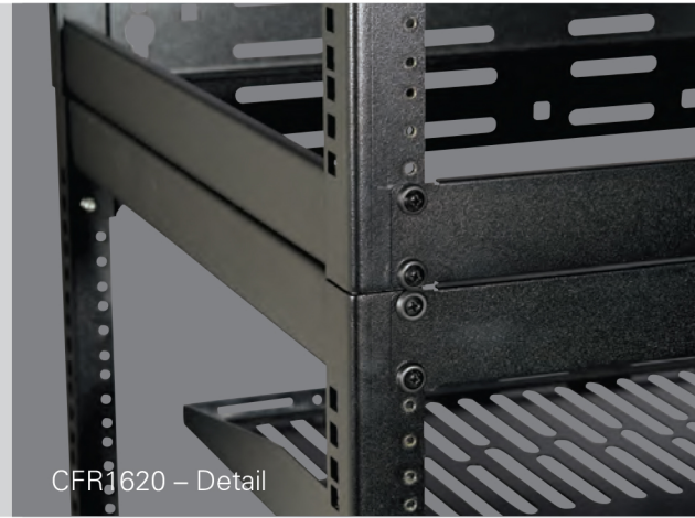
CFR1620 – Detail

This versatile rack can be assembled without special tools in less than ten minutes. The self-aligning structure requires only four bolts to stack. Choose from seven possible height combinations, from 10U to 40U, for added customization. Compatible with the EcoSystem™ and small parts panel, Stackable Racks are the best way to increase the efficiency of your system. Plastic feet are included for easy sliding and leveling. Plus, choose a caster kit for added mobility or swivel kit for increased serviceability.