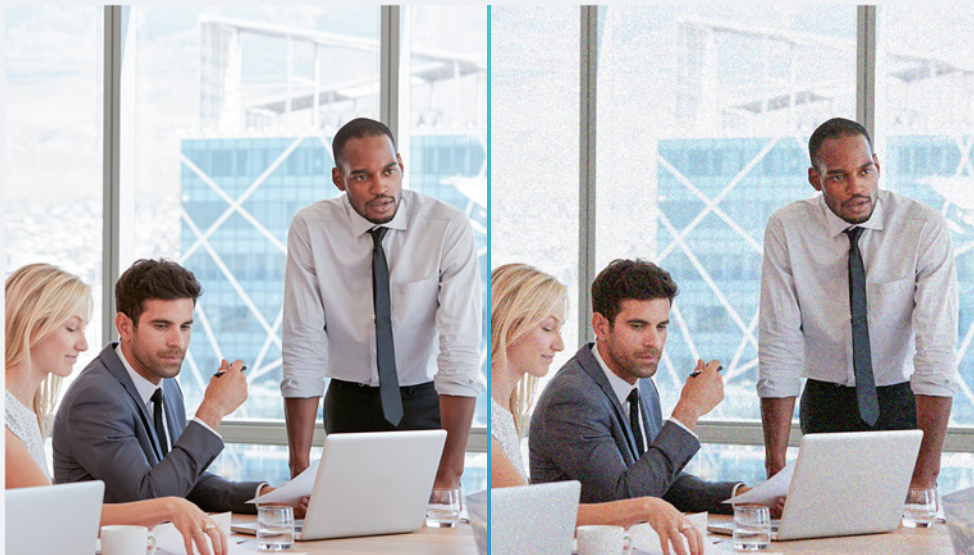
After 2D & 3D DNR