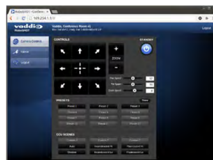
Example: Built-in Camera Control Web Page