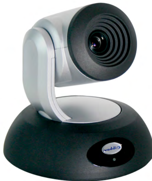
Image: RoboSHOT 12 USB, HD PTZ Camera with 12X Optical Zoom and 73° Wide Horizontal Field of View

The RoboSHOT 12 USB camera was designed for the times and represents a new era in specifying and integrating professional quality cameras into UC Conferencing and Pro AV system configurations. The features, flexibility and the value of the RoboSHOT 12 USB conferencing camera is unparalleled in today's PTZ camera market. All this and it's made in the USA, at the Vaddio HQ in Minnetonka, Minnesota.