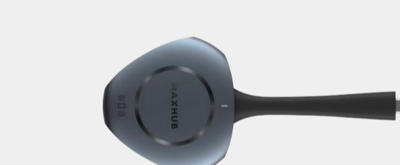
Wireless Dongle (WT13)