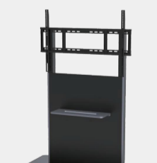
Mobile Stand (ST23C)