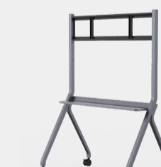
Mobile Stand (ST41B)